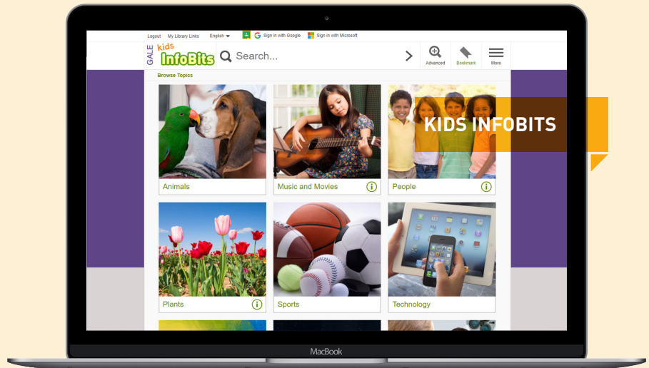
Product screen capture as of March 2018. Actual Interface may vary.