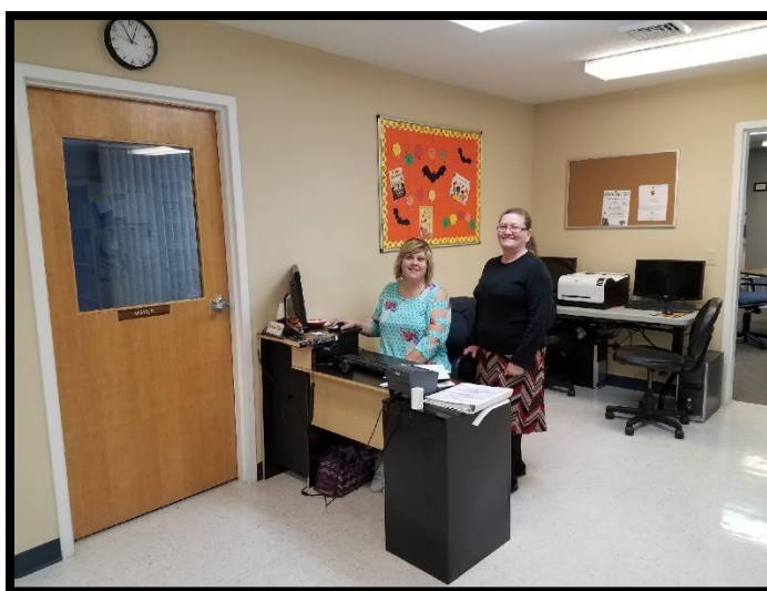
Ramsey Public Library staff on Go Live day!