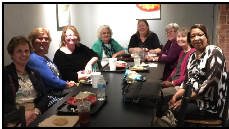
October Members Matter Luncheon