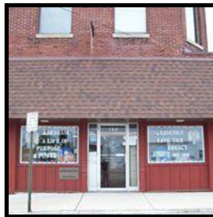
Clifton Public Library