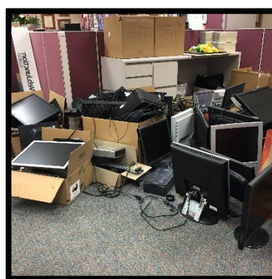
Surplus Electronic Items